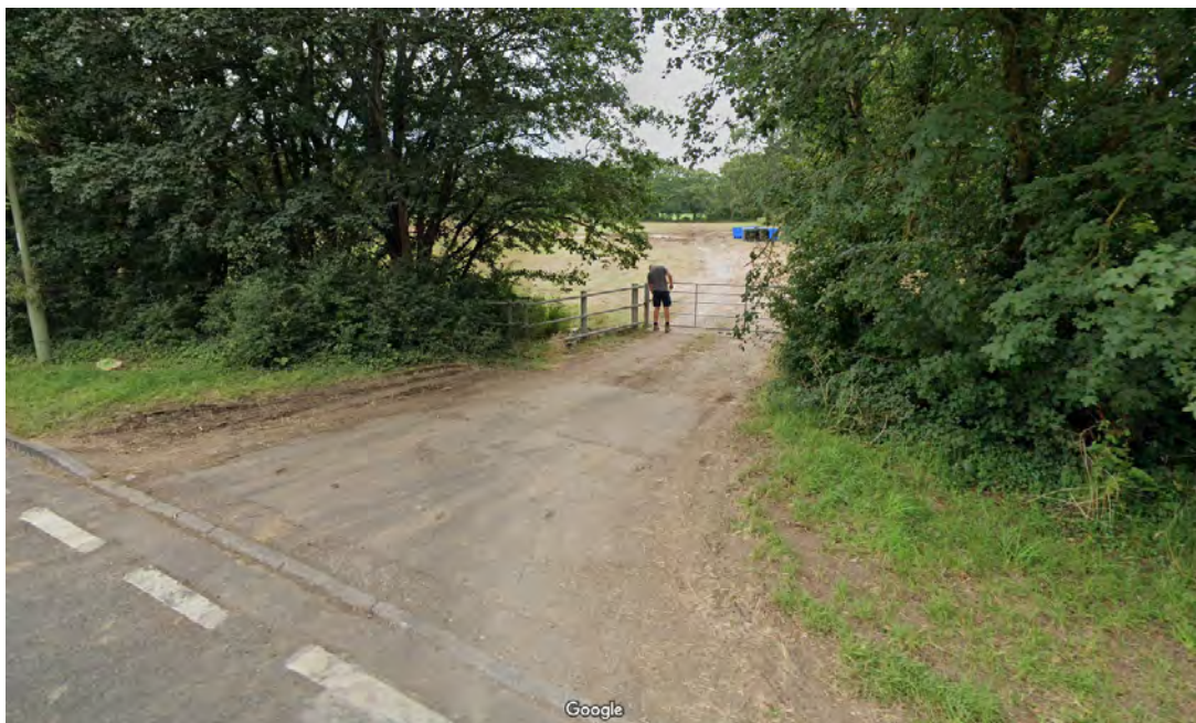
Figure 1.2: Show Entrance gate.