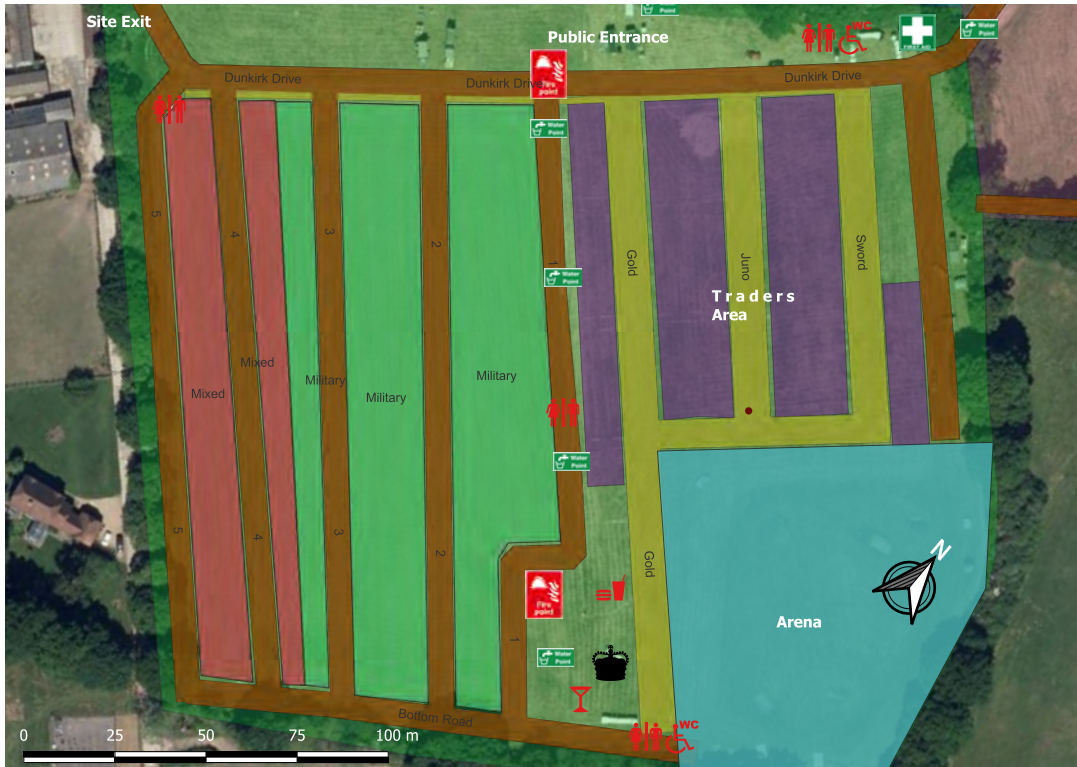
Figure 2.1: Vehicle Exhibitors Field indicating permitted camping. Military camping is military-style tents only. Mixed camping is any form of camping including civilian tents, campervans/motorhomes.