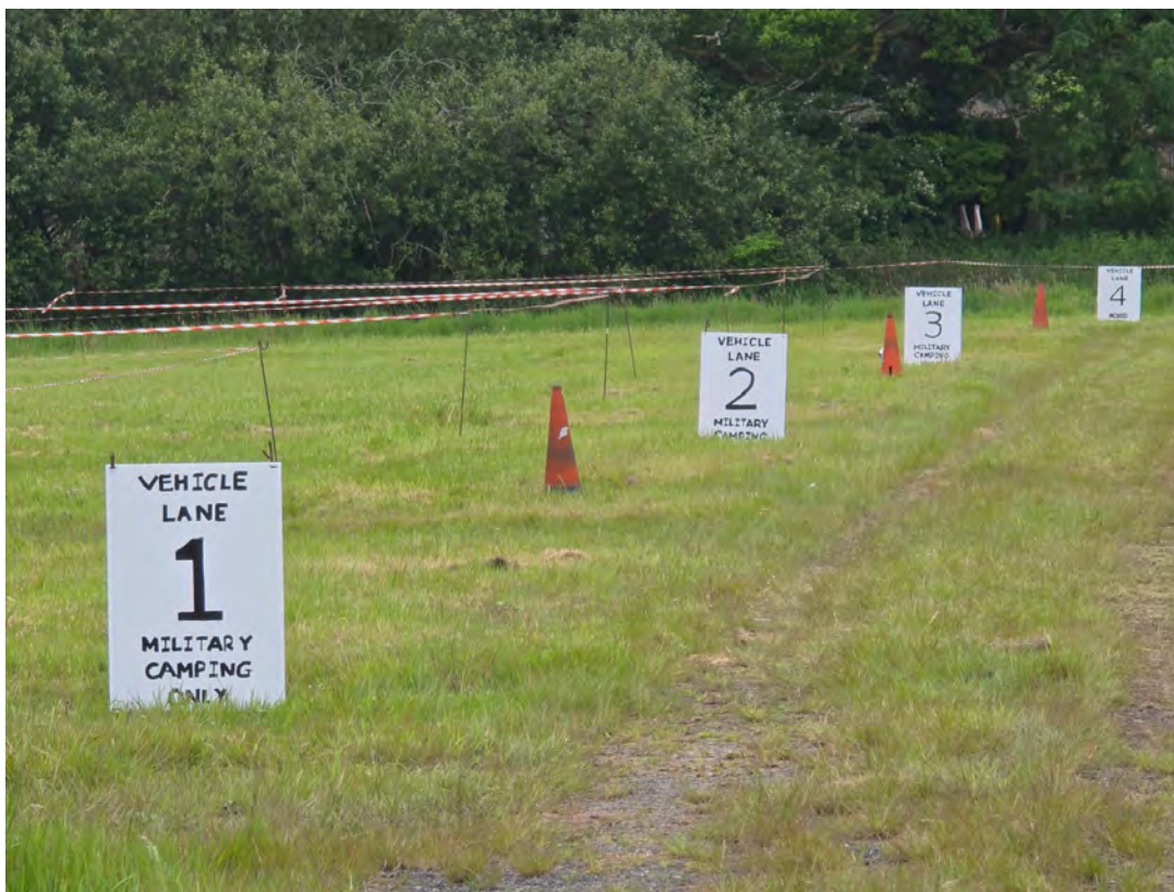
Figure 2.2: Signs indicated lane number and permitted camping