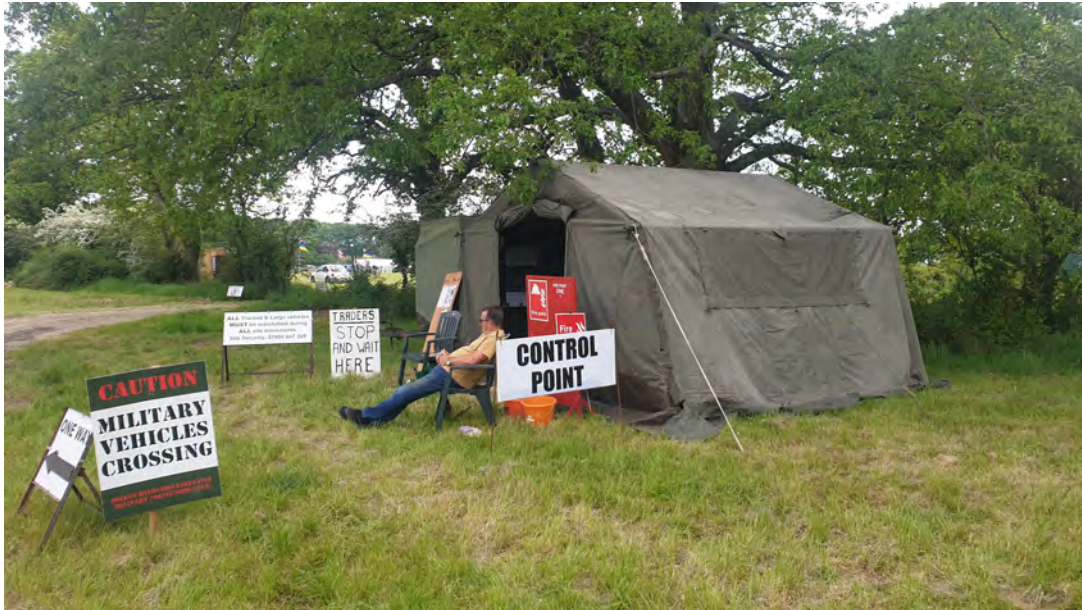
Figure 1.6: Command Tent

Please note the command tent, may in-fact be a container instead of a tent.