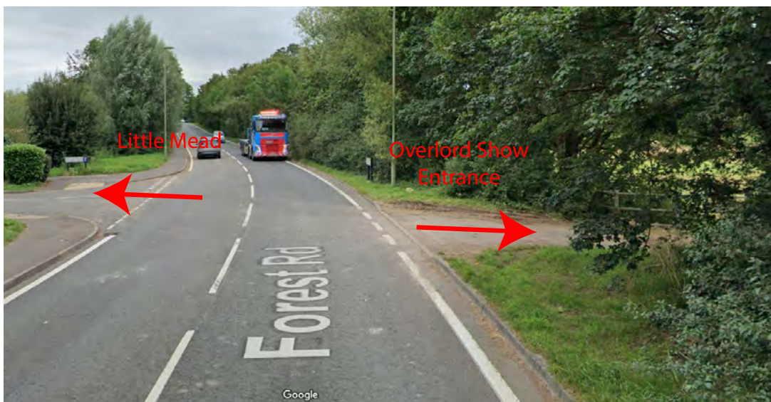
Figure 1.4: Show entrance as seen from east. No right turn onto show site unless unable to make u-turn. This is to reduce traffic build-up.