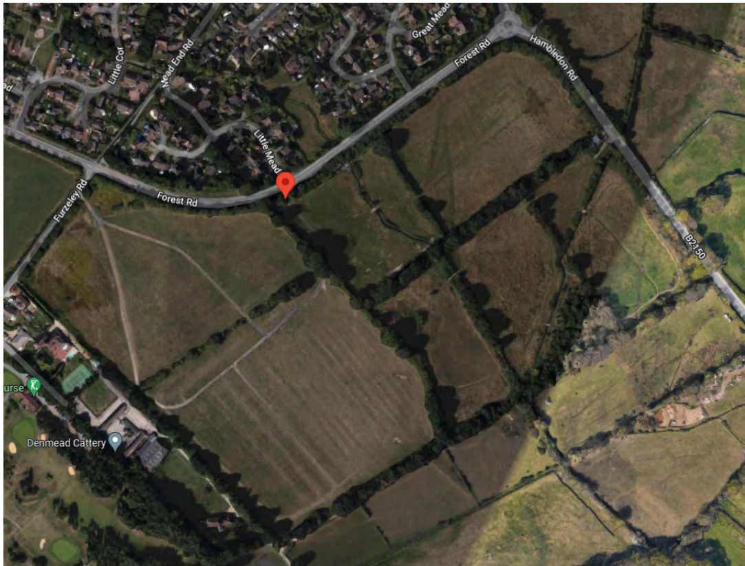
Figure 1.1: Show Location