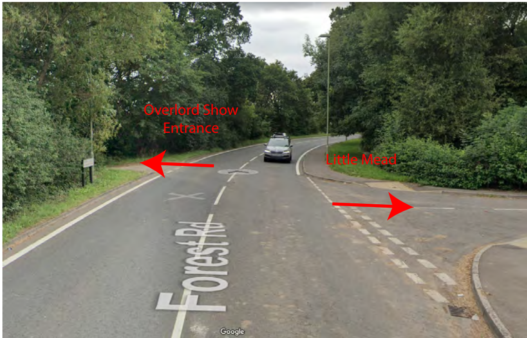
Figure 1.3: Show entrance as seen from west (A3(M) route)