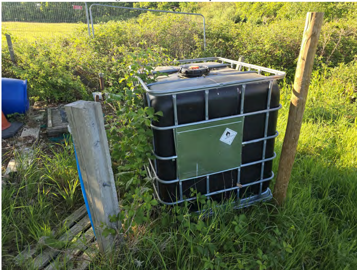
Figure 1.7: Chemical Disposal Point